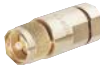
UHF Male 44ASP