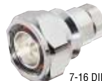
7-16 DIN Male F4PDMV2-C