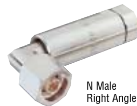
N Male Right Angle F4PNR-H