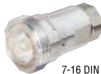
7-16 DIN Female F4PDF-C