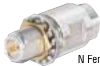
N Female Bulkhead F4PNF-BH