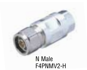
N Male F4PNMV2-H